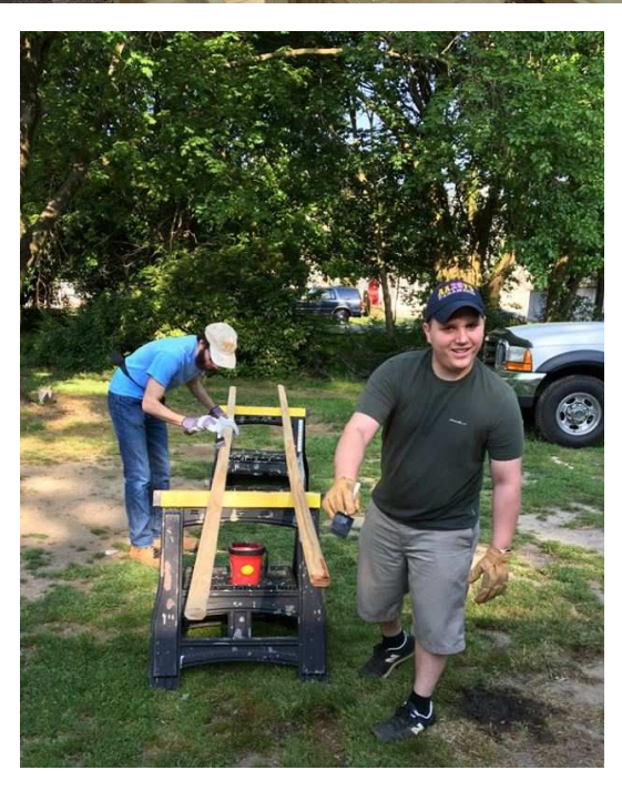
Serving God, by serving others!